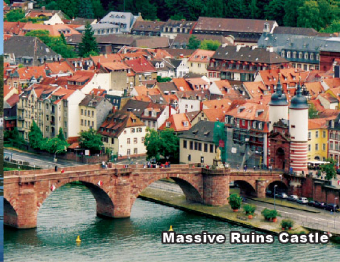
Massive Ruins Castle