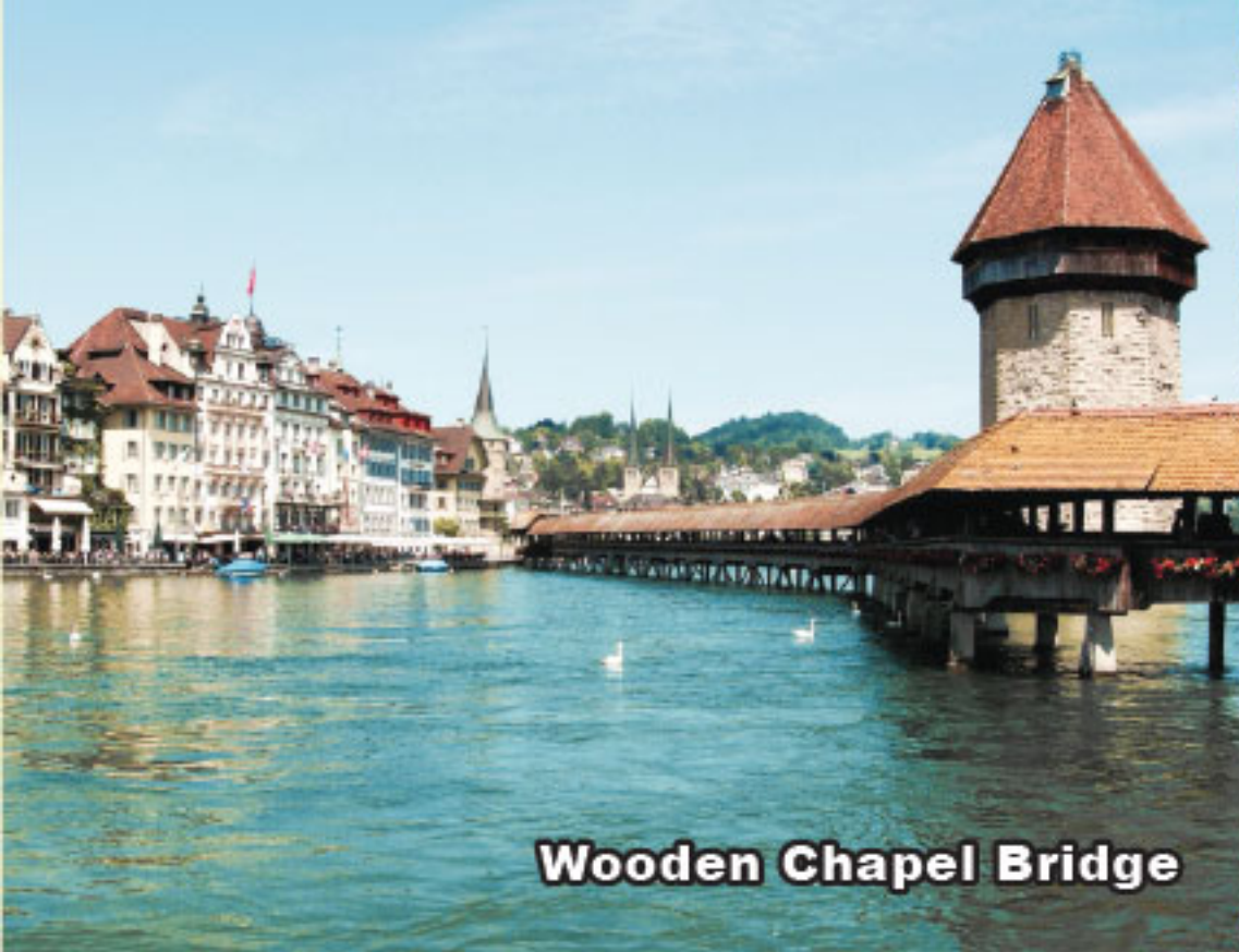
Wooden Chapel Bridge